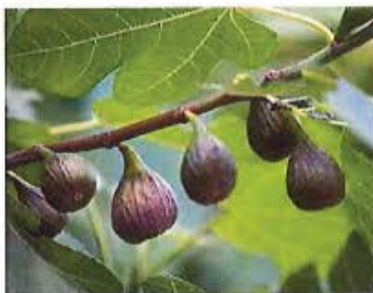
Fig trees have come to symbolize prosperity, fertility, knowledge, and sweetness.

In fact, many experts surmise that a fig, not an apple, was the fruit eaten in the Garden of Eden. Ancient Romans believed figs bestowed youth, vitality, and smooth skin. Early Olympians relied on the high fiber fruit to improve their workouts, and winners received fig laurels rather than the gold, silver, and bronze medals of today.